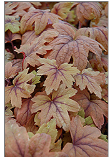
Sweet Tea Foamy Bells foliage