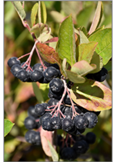
Viking Chokeberry fruit

This shrub should only be grown in full sunlight. It is an amazingly adaptable plant, tolerating both dry conditions and even some standing water. It is not particular as to soil type or pH, and is able to handle environmental salt. It is somewhat tolerant of urban pollution. This particular variety is an interspecific hybrid.