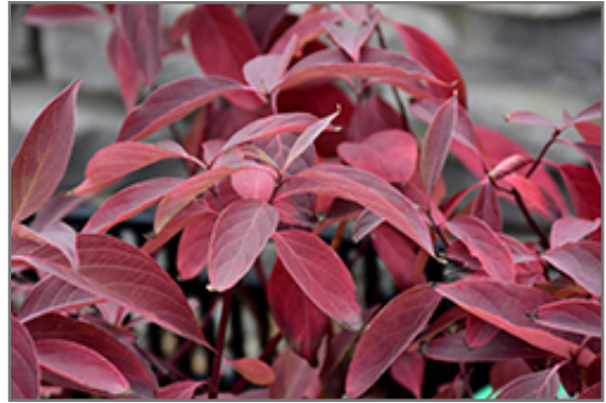
Arctic Fire Red Twig Dogwood in fall

This shrub does best in full sun to partial shade. It is an amazingly adaptable plant, tolerating both dry conditions and even some standing water. It is not particular as to soil type or pH. It is highly tolerant of urban pollution and will even thrive in inner city environments. This is a selection of a native North American species.