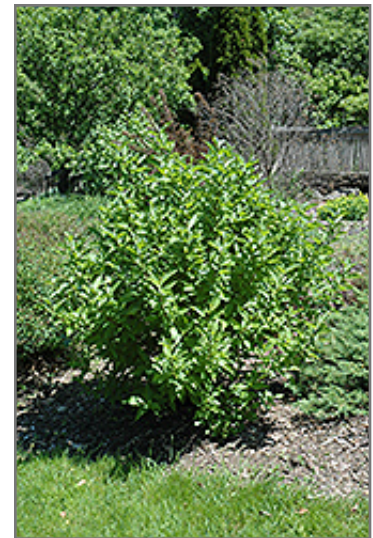
Arctic Fire Red Twig Dogwood