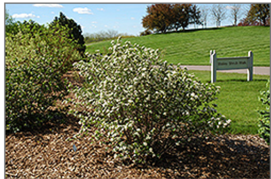
Autumn Magic Black Chokeberry in bloom