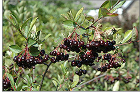
Autumn Magic Black Chokeberry fruit

This shrub should only be grown in full sunlight. It is an amazingly adaptable plant, tolerating both dry conditions and even some standing water. It is not particular as to soil type or pH, and is able to handle environmental salt. It is somewhat tolerant of urban pollution. This is a selection of a native North American species.