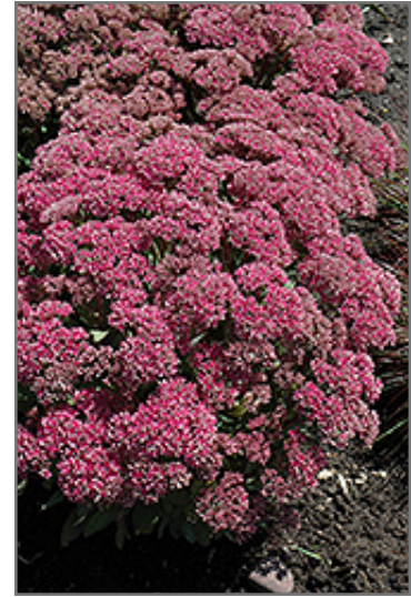
Mr. Goodbud Stonecrop flowers

Mr. Goodbud Stonecrop is recommended for the following landscape applications;