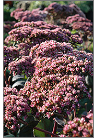
Maestro Stonecrop flowers

This is a relatively low maintenance plant, and is best cleaned up in early spring before it resumes active growth for the season. It is a good choice for attracting bees and butterflies to your yard, but is not particularly attractive to deer who tend to leave it alone in favor of tastier treats. It has no significant negative characteristics.