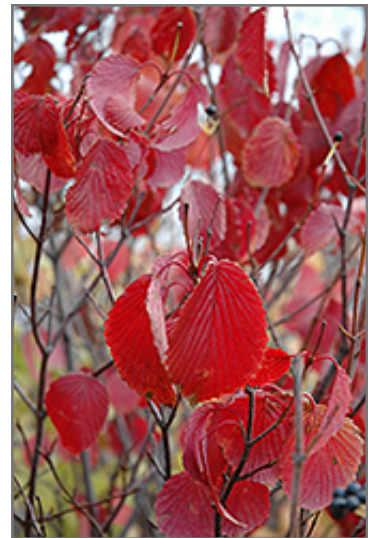
Arrowwood in fall