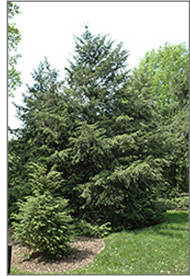
Canadian Hemlock

Canadian Hemlock is recommended for the following landscape applications;