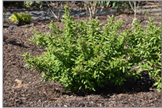
Red Gnome Dogwood