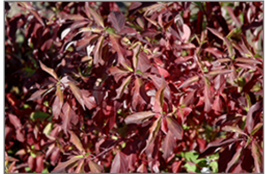
Red Gnome Dogwood in fall

This shrub does best in full sun to partial shade. It is an amazingly adaptable plant, tolerating both dry conditions and even some standing water. It is not particular as to soil type or pH. It is highly tolerant of urban pollution and will even thrive in inner city environments. This is a selected variety of a species not originally from North America.