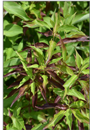
Red Gnome Dogwood foliage