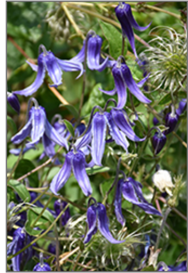
Solitary Clematis flowers