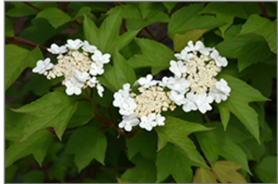
Redwing Highbush Cranberry flowers

Redwing Highbush Cranberry is a dense multi-stemmed deciduous shrub with an upright spreading habit of growth. Its average texture blends into the landscape, but can be balanced by one or two finer or coarser trees or shrubs for an effective composition.