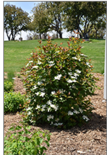
Redwing Highbush Cranberry in bloom