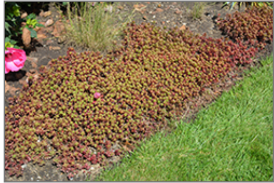
Fulda Glow Stonecrop