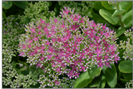
Neon Stonecrop flower buds