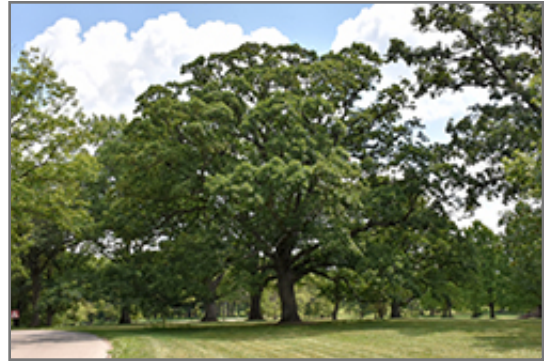
White Oak Photo courtesy of NetPS Plant Finder