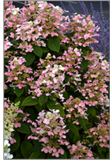
Quick Fire Hydrangea flowers