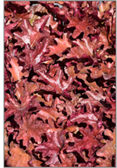
Peach Flambe Coral Bells foliage

This is a relatively low maintenance plant, and should be cut back in late fall in preparation for winter. It is a good choice for attracting hummingbirds to your yard. It has no significant negative characteristics.