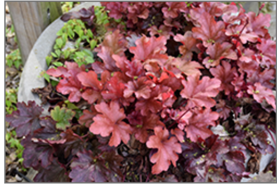
Peach Flambe Coral Bells

Peach Flambe Coral Bells will grow to be about 8 inches tall at maturity extending to 16 inches tall with the flowers, with a spread of 16 inches. When grown in masses or used as a bedding plant, individual plants should be spaced approximately 14 inches apart. Its foliage tends to remain low and dense right to the ground. It grows at a medium rate, and under ideal conditions can be expected to live for approximately 10 years. As an evergreen perennial, this plant will typically keep its form and foliage year-round.