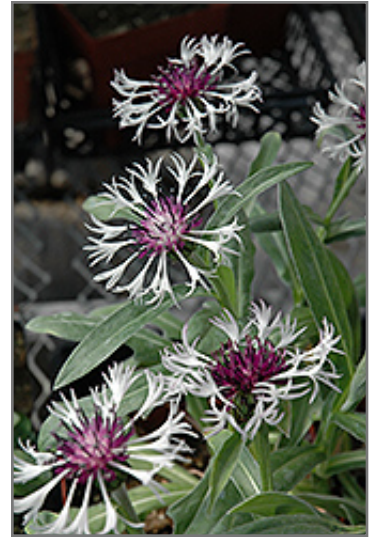
Amethyst In Snow Cornflower flowers

Amethyst In Snow Cornflower is recommended for the following landscape applications;