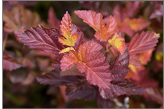
Center Glow Ninebark foliage

Center Glow Ninebark is recommended for the following landscape applications;