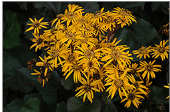
Britt Marie Crawford Rayflower flowers