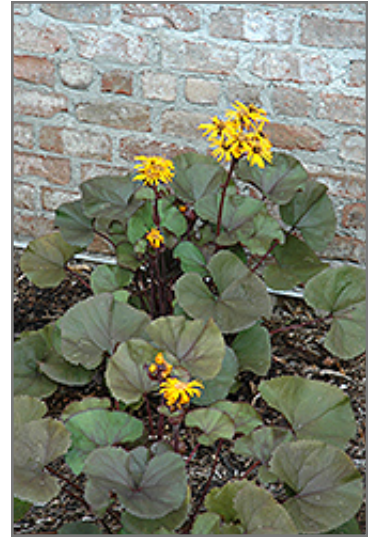
Britt Marie Crawford Rayflower in bloom