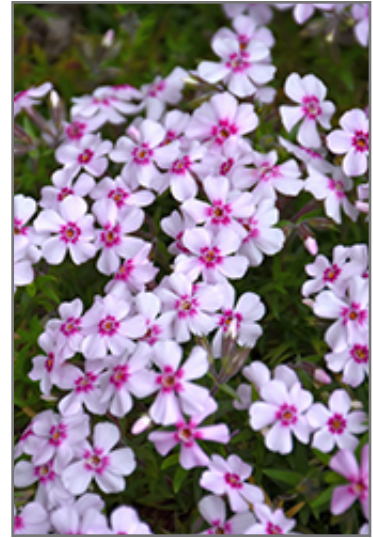
Coral Eye Moss Phlox flowers