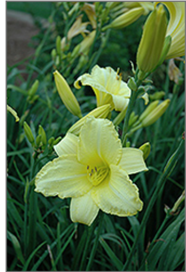
Happy Ever Appster Happy Returns Daylily flowers

Happy Ever Appster Happy Returns Daylily is recommended for the following landscape applications;