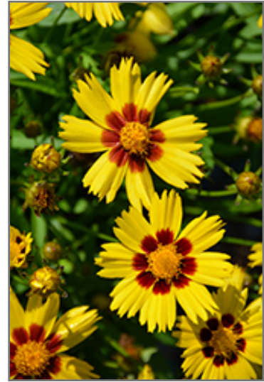
Sunkiss Tickseed flowers