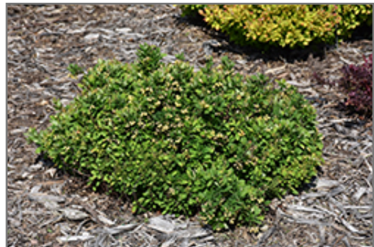
Moscato Barberry