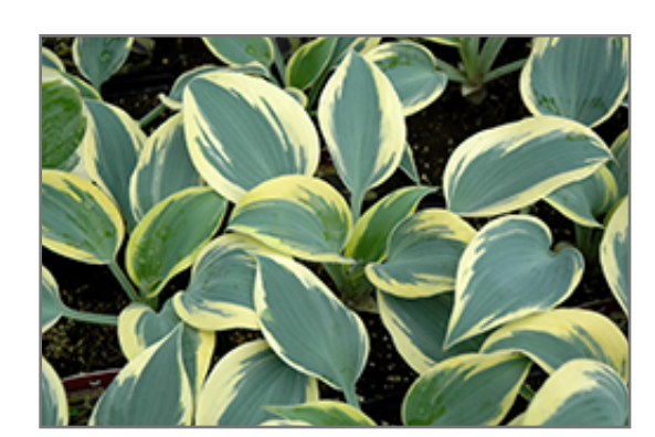
Ben Vernooji Hosta foliage