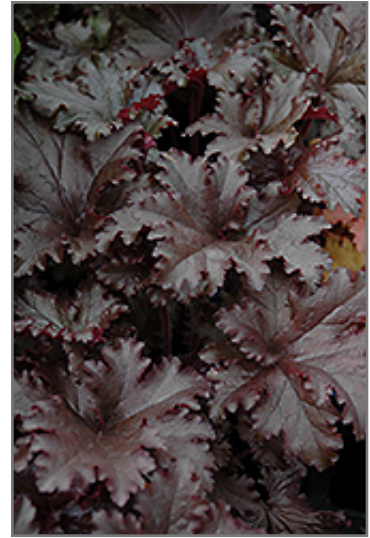
Black Taffeta Coral Bells foliage

Black Taffeta Coral Bells is recommended for the following landscape applications;