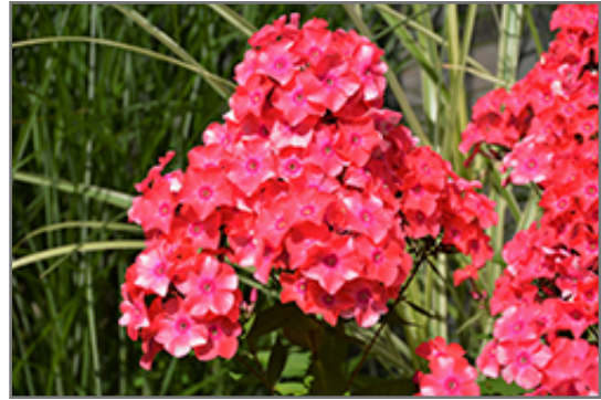
Flame Coral Garden Phlox flowers

This plant will require occasional maintenance and upkeep, and should be cut back in late fall in preparation for winter. It is a good choice for attracting butterflies and hummingbirds to your yard. Gardeners should be aware of the following characteristic(s) that may warrant special consideration;