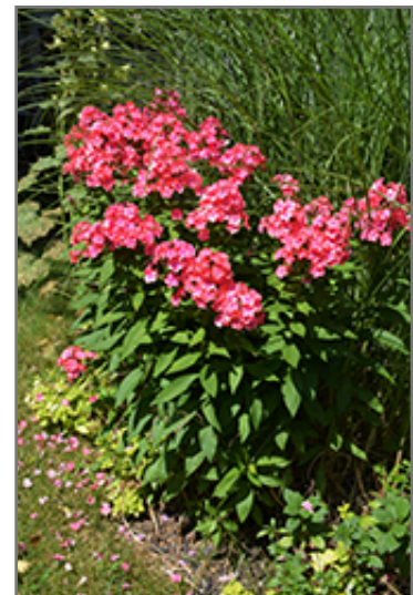
Flame Coral Garden Phlox in bloom