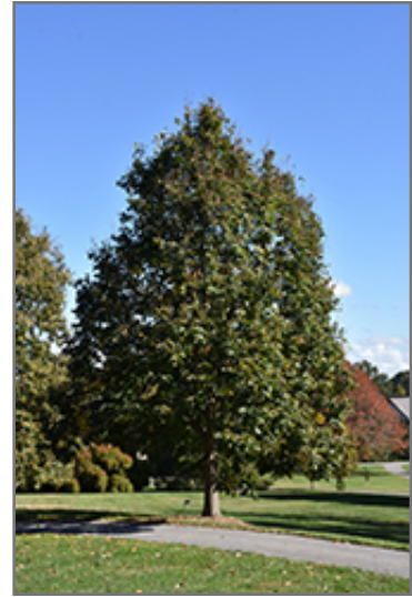
Redmond Linden

Redmond Linden is recommended for the following landscape applications;