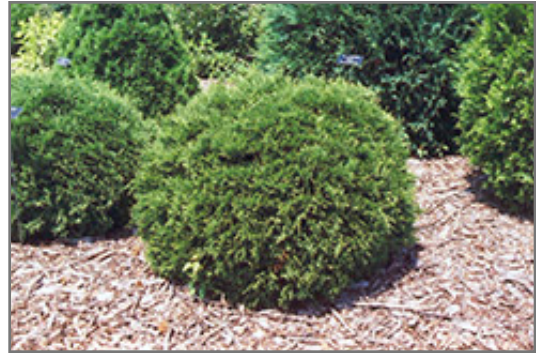
Hetz Midget Arborvitae