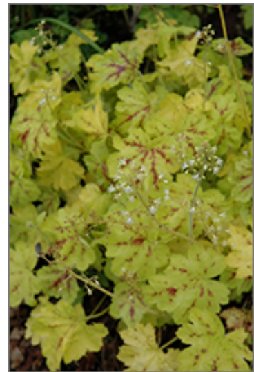
Solar Power Foamy Bells flowers