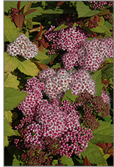
Double Play Big Bang Spirea flowers

This shrub will require occasional maintenance and upkeep, and is best pruned in late winter once the threat of extreme cold has passed. It is a good choice for attracting butterflies to your yard, but is not particularly attractive to deer who tend to leave it alone in favor of tastier treats. It has no significant negative characteristics.