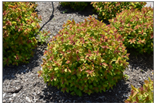
Double Play Big Bang Spirea