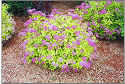
Goldmound Spirea in bloom

This shrub should only be grown in full sunlight. It prefers to grow in average to moist conditions, and shouldn't be allowed to dry out. It is not particular as to soil type or pH. It is highly tolerant of urban pollution and will even thrive in inner city environments. This is a selected variety of a species not originally from North America.