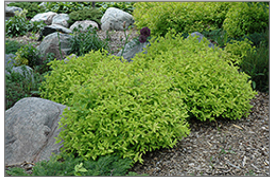
Goldmound Spirea

Goldmound Spirea is recommended for the following landscape applications;