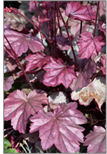
Stainless Steel Coral Bells foliage