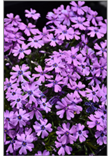
Purple Beauty Moss Phlox flowers