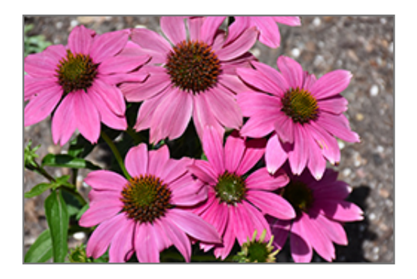
PowWow Wild Berry Coneflower flowers