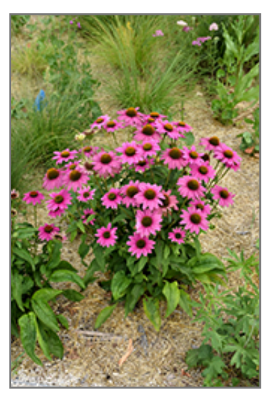
PowWow Wild Berry Coneflower in bloom

This is a relatively low maintenance plant, and is best cleaned up in early spring before it resumes active growth for the season. It is a good choice for attracting birds and butterflies to your yard, but is not particularly attractive to deer who tend to leave it alone in favor of tastier treats. It has no significant negative characteristics.