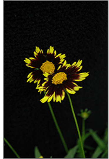
Cosmic Eye Tickseed flowers

Cosmic Eye Tickseed is recommended for the following landscape applications;