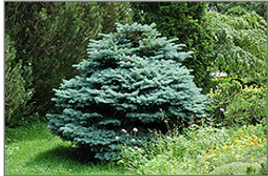
Globe Blue Spruce