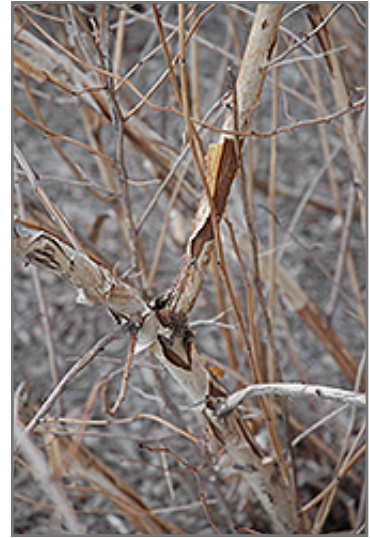
Diablo Ninebark bark

This shrub does best in full sun to partial shade. It is very adaptable to both dry and moist locations, and should do just fine under average home landscape conditions. It is not particular as to soil type or pH. It is highly tolerant of urban pollution and will even thrive in inner city environments. This is a selection of a native North American species.