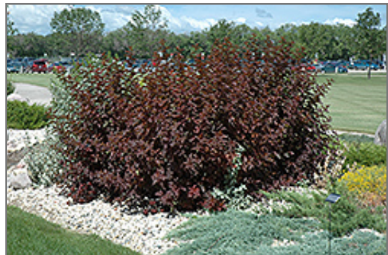
Diablo Ninebark