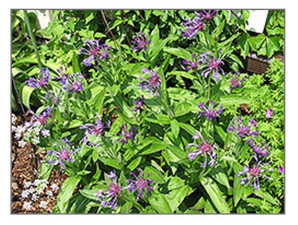
Blue Cornflower in bloom

This plant will require occasional maintenance and upkeep, and is best cleaned up in early spring before it resumes active growth for the season. It is a good choice for attracting butterflies to your yard. Gardeners should be aware of the following characteristic(s) that may warrant special consideration;