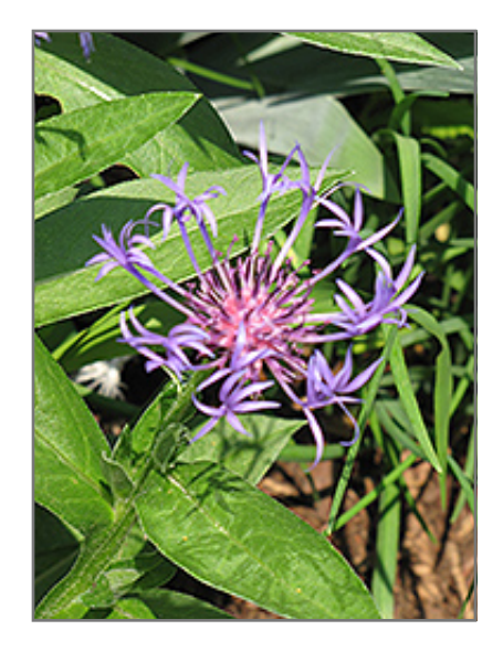
Blue Cornflower flowers