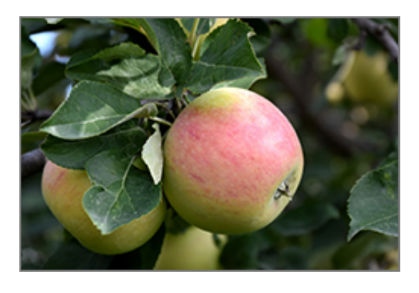
Goodland Apple fruit

Goodland Apple features showy clusters of lightly-scented white flowers with shell pink overtones along the branches in mid spring, which emerge from distinctive pink flower buds. It has forest green deciduous foliage. The pointy leaves turn yellow in fall. The fruits are showy light green apples with a red blush, which are carried in abundance from late summer to early fall. The fruit can be messy if allowed to drop on the lawn or walkways, and may require occasional clean-up.