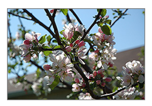
Goodland Apple flowers